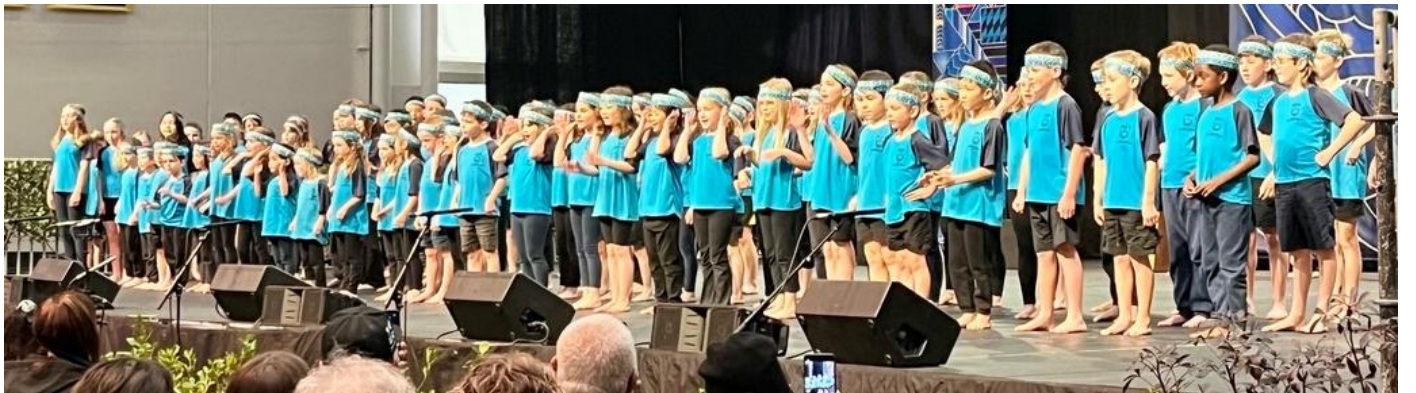
Photo: Our students at 2024 Polyfest